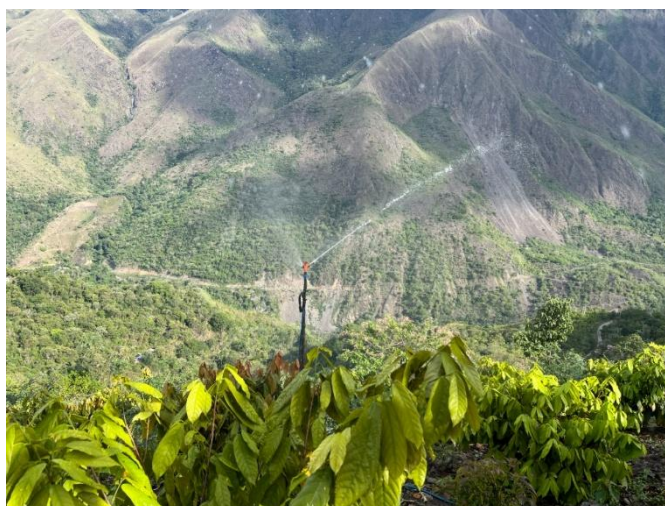
One of dozens of sprinkler systems that irrigate the agricultural land there all year round.