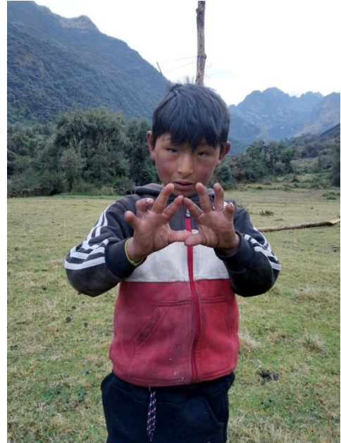
The boy's hands after the operation.