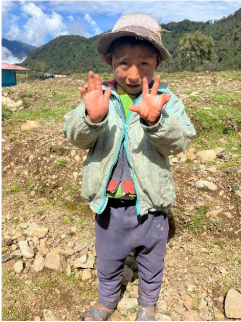
The boy's hands before the operation.