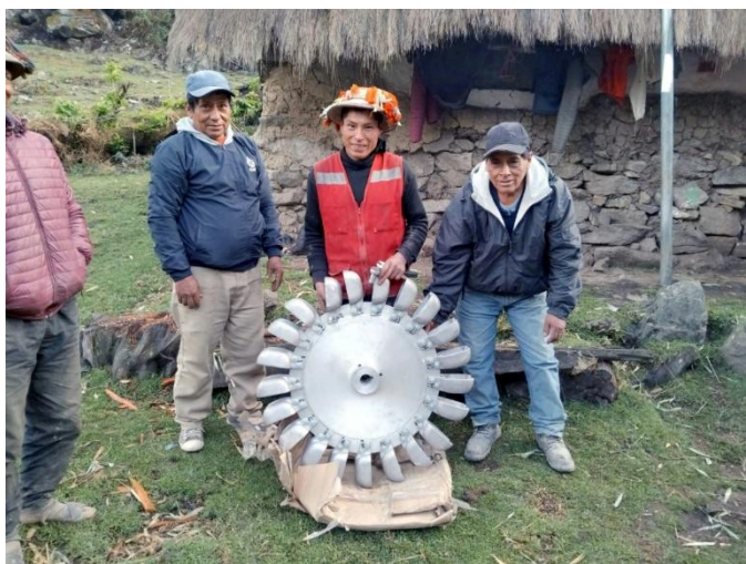
The Pelton turbine with the impeller blades converts the kinetic energy of the water into electricity.

There will be further details about this project in the next annual report.