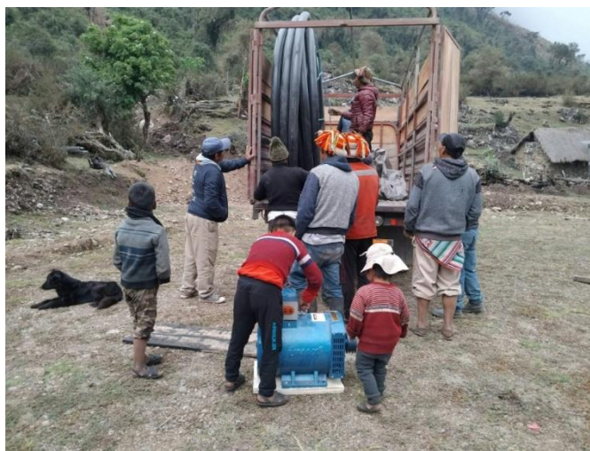
Unloading the heavy dynamo motor for an output of 20 kilowatt hours of electricity.