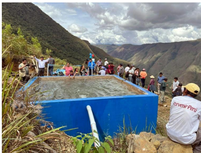
One of two water reservoirs, with a capacity of 10,000 litres, for irrigating agricultural land.